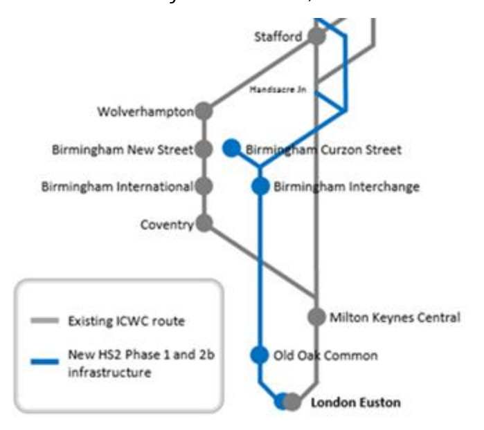
Figure 2: Extract of the HS2 phase 1 route proposal

The building of the new High Speed 2 railway will take trains off the existing railway and place them on to dedicated high speed tracks. The main aims of this are to improve journey times for long-distance high-speed services running on these new lines and to 'free up' capacity which could be used effectively by both long-distance and suburban passenger services, and freight services on the conventional network. However, it is anticipated that some existing WCML services will continue in similar form to today, though potentially with adjusted stopping patterns and timings. These are expected to include long distance services to Birmingham New Street and extensions from there to Shrewsbury and Scotland, and services to Chester and North Wales.