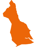
North & East

We are an incredibly busy region, operating some of the busiest rail lines in the country. We transport commuters to and from busy cities including Newcastle, Leeds, Sheffield, Derby, Norwich, Cambridge and London, and serve two airports and 13 freight ports. We connect people to friends and family, jobs and leisure, as well as goods to businesses here and abroad. Improving our rail network and getting people where they need to be on time makes a massive difference to the UK economy, helping bring jobs, homes and prosperity.